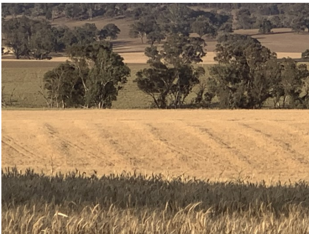
Photo shows waves in our 2019 wheat crop where canola residues were left on the ground after harvest in 2018. The stubble residue conserved more moisture, provided more microbial activity and increased production up to 3 times greater than the dips. WHY ARE FARMERS BALING THEIR STUBBLES AND TAILINGS?? Maybe short term gain for long term pain!!! - Alarm Bells should be ringing!

As we all know soils are one of the proven methods of sequestering carbon and reducing green house gas emissions, helping to avert the future destruction of climate change. 2019 saw the first soil carbon traded, setting the example of what is possible in the future.